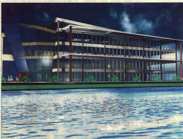
The glass front of the Gateway Building in Winter Haven will offer an unobstructed view of Lake Ebert. The building, designed by architect Claudio Noriega, was inspired by contemporary international designs.